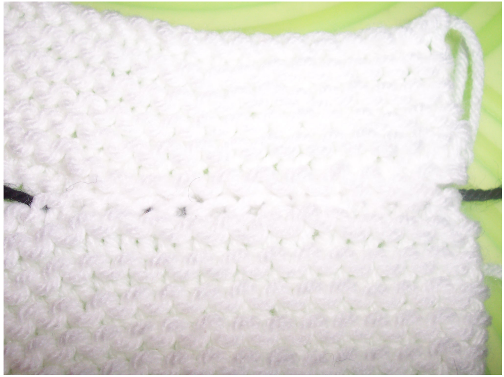
Can you find my seam?? Even with using black yarn, it's invisible!