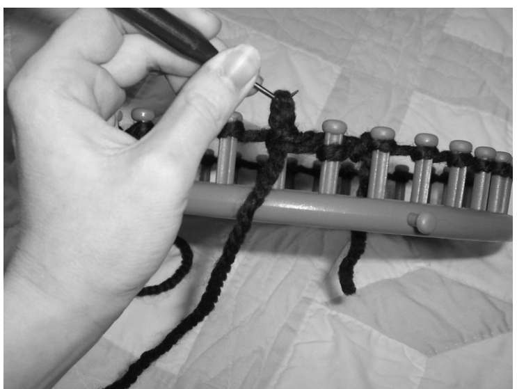
5: Move to the next peg and repeat stitch as called for in the pattern.